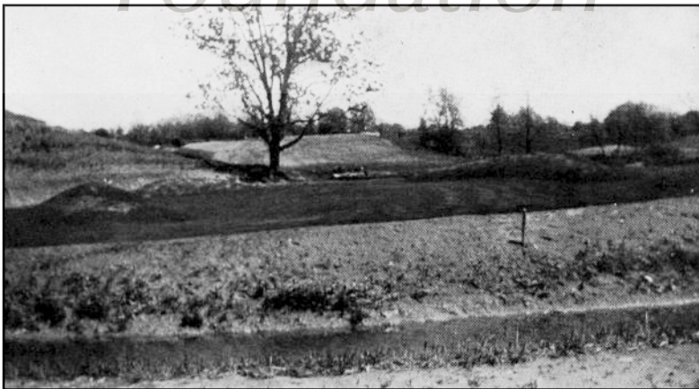
View showing the sixteenth green at the new Columbia Country Club course at Chevy Chase, Md. The putting green is modeled after the twelfth at Garden City. Immediately in front is a brook which partially encircles the green. The hole is about 145 yards in length.