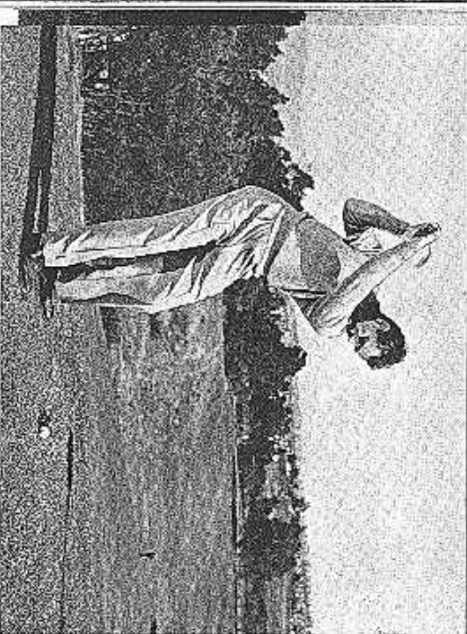
A side view of the No. 5 iron shot at the top of the backswing.