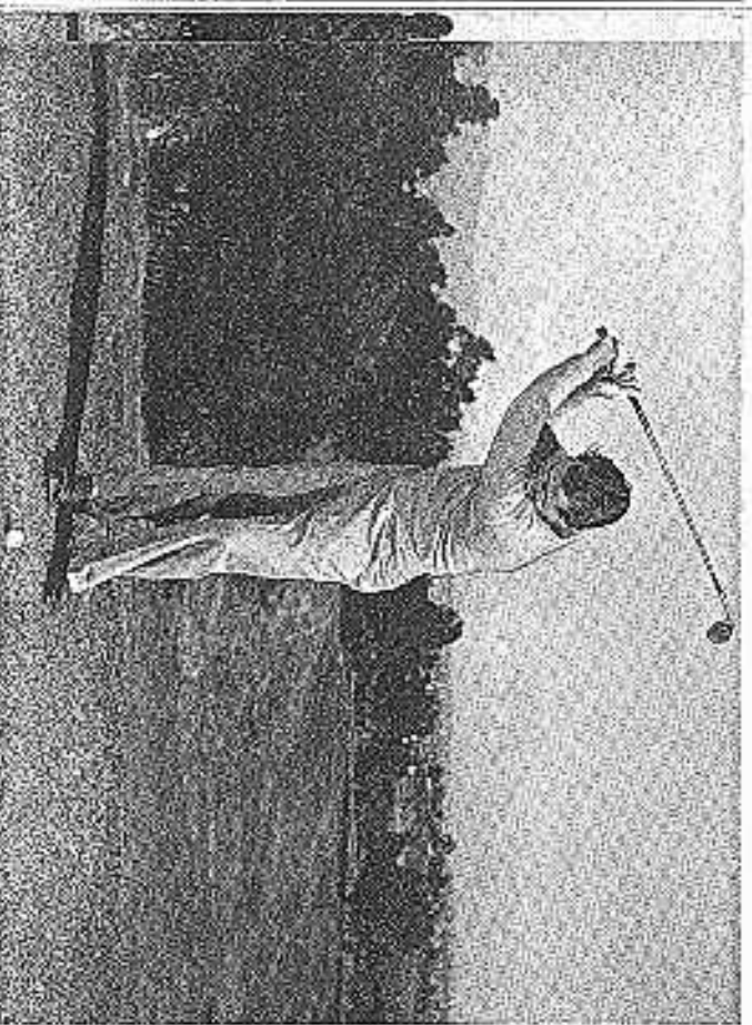
Start of downswing, illustrating pulling down of club by left arm.