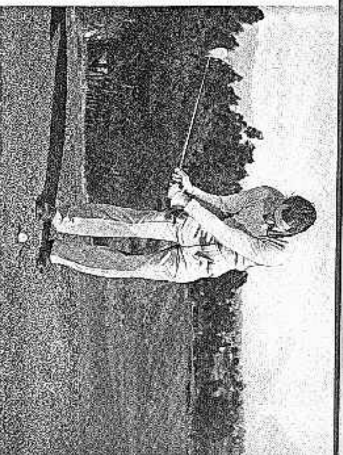
No. 9 iron shot with the club about halfway down in the downswing.