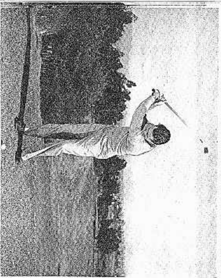
Front view: Tody is bent more in this shot than in other iron shots.