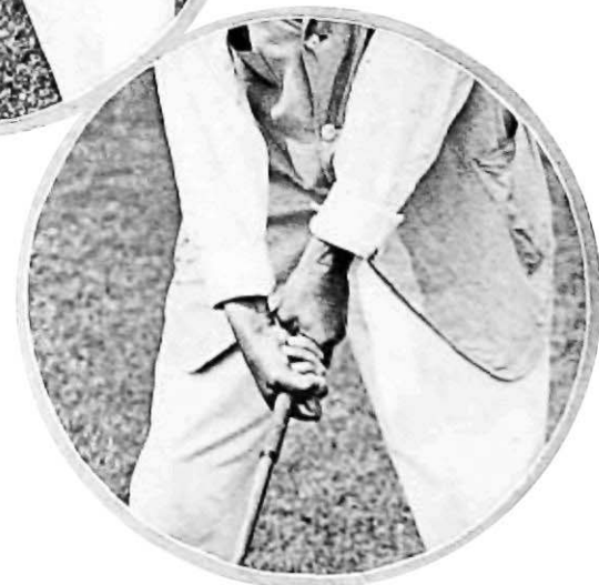
Illustrations of varying grips in driving, described in the accompanying article, by reference to numbers as follows: Circular from top to bottom, No. 1, left hand under; No. 2, left hand over; No. 5, right hand under; Figure A, palm grip; Octagonal, upper, No. 3, grip at top of swing; lower, right hand over